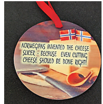
Until next time! Loretta Pratt--Publicity

On the lighter side, Aging is like a lifelong game of hide and seek-- You're always trying to find where you left your glasses.