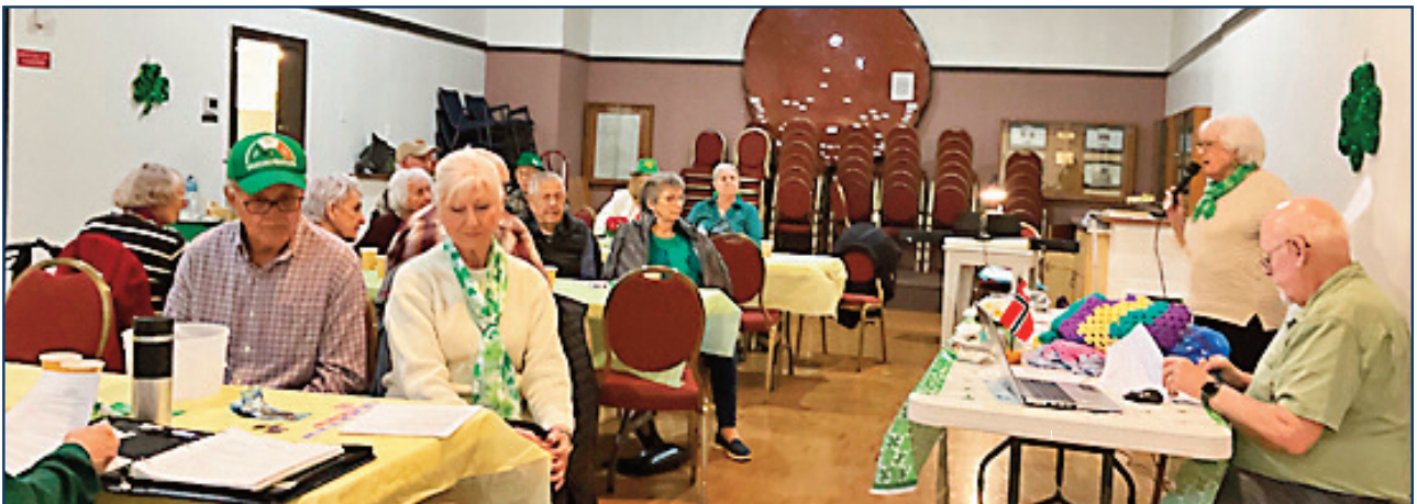
Viking Members at meeting with hall decorated for St. Patrick's Day