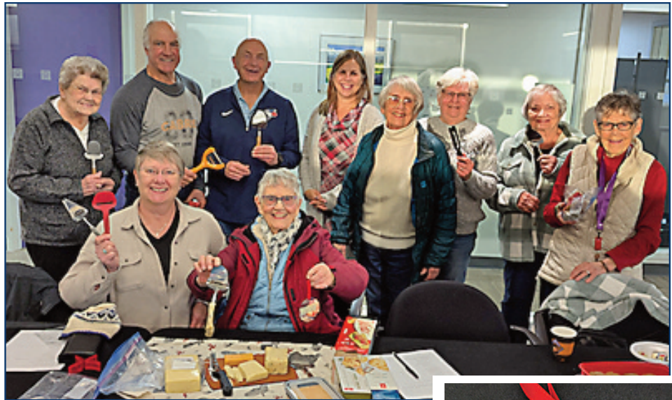
All of our Lodge members enjoyed the cheese presentation at the meeting.