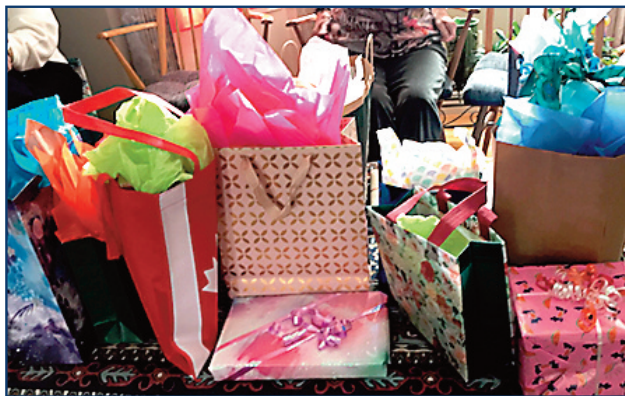
The gifts all wrapped up for the Thrift Store Gift Exchange

we can use it for free, same deal as at the Carmel. So that is where our February meeting was held on February 19, with 13 members present. At this meeting we needed to find who were able to attend the Convention, to be held in Port Alberni.