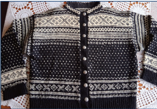
A 67 year old Norwegian sweater

That turned out to be our last meeting at Carmel Restaurant, as the place was sold not long after that, and we had to find a new place for our meetings. Someone suggested Bon Voyage Restaurant, which also has a nice, big hall for our meetings. And if we buy our lunch there, the